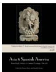
Asia & Spanish America: Trans-Pacific Artistic & Cultural Exchange, 1500-1850 (2006 Symposium)