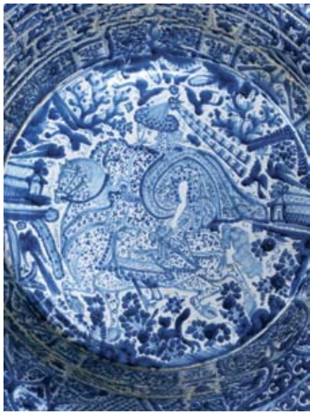
(detail) Anonymous, Basin (lebrillo). Puebla, Mexico, late 17th c. Earthenware, lead/tin glaze, cobalt in-glaze paint. 6 h. x 26 dia. in. Denver Art Museum: Funds from 2001 Collectors' Choice, 2001.314.

Friday 9:30AM-5:30PM | Saturday 9:30AM-12:30PM